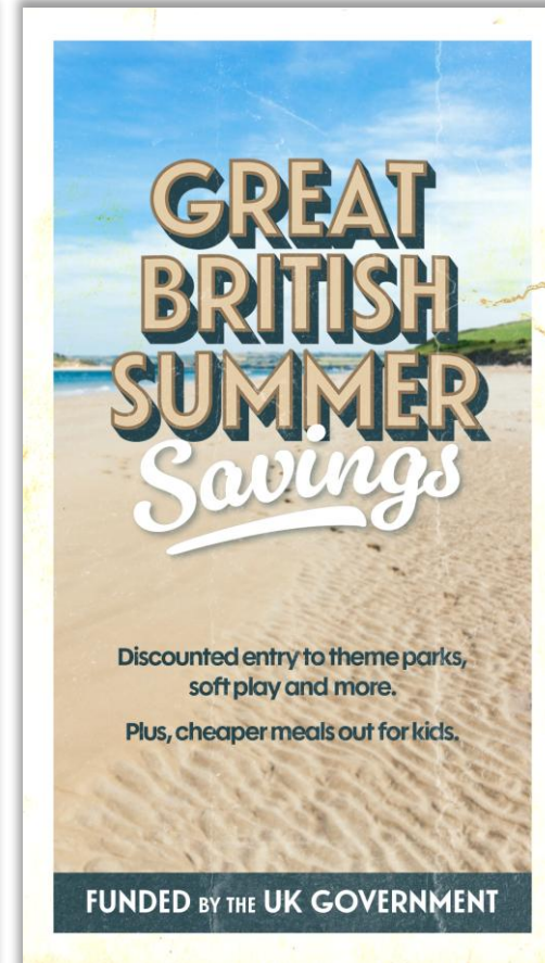
1080x1920 Social Post