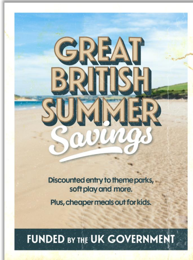
1080x1440 Social Post